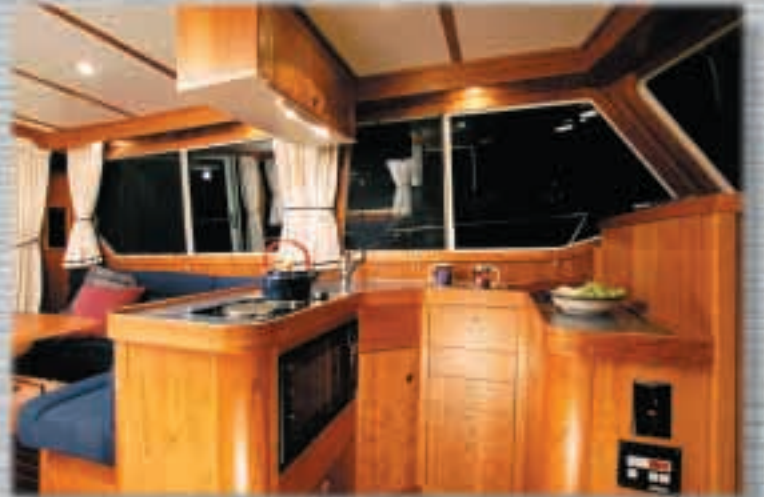
The spacious galley

And to be sure that her galley is as easy to use underway as it is at the dock, galley counters are bordered with laminated wooden fiddles to prevent your dishes from sliding off the work surface.