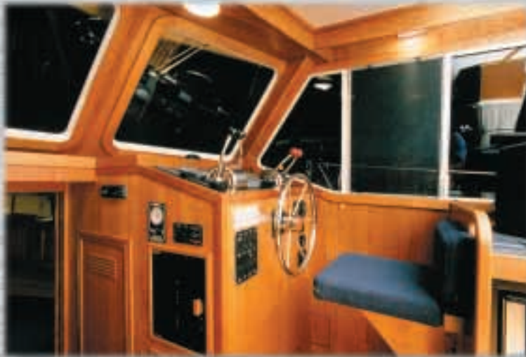
The fully equipped lower helm

Unlike many boats of this size, the Sabreline 34 has, as standard equipment, a full lower helm. Here the helmsman can navigate when the weather is too hot or too cold to be out of doors. It is also a nice spot to enjoy a meal while underway. An optional sliding door is available for more immediate access to the side deck from the helm station.