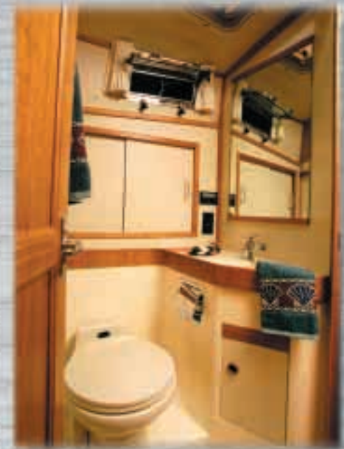
The fully equipped head with shower stall

A full shower stall with teak grate is found aft of the head compartment and a bifold door separates the head from the shower.