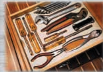
The Sabre Tool Drawer. Just one example of many details to be found aboard a Sabreline.

Our skilled craftsmen and women take tremendous pride in their work and strive to provide our owners with the highest possible quality in the yachts that we build.