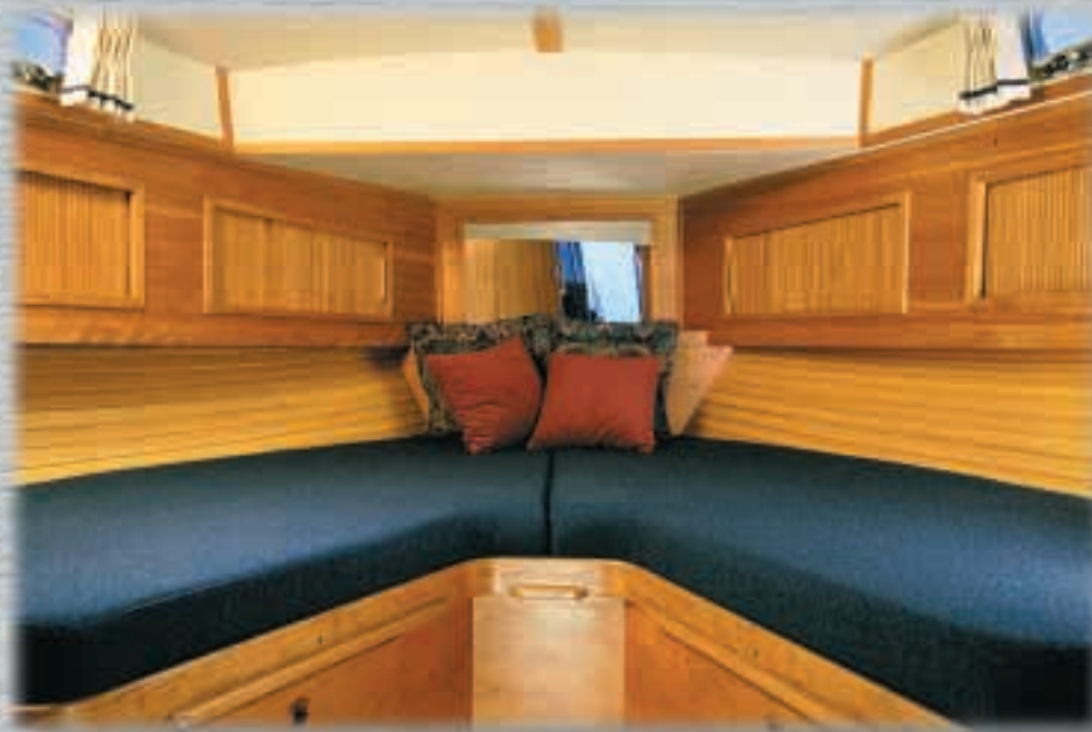
The master cabin is available with a center island berth.